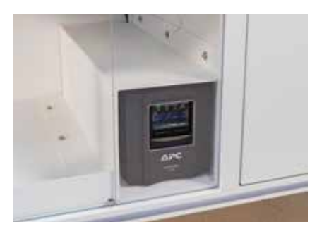
On board UPS Universal Power Supply