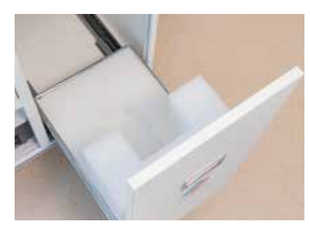
Preformed foam support to hold microscope during transfer