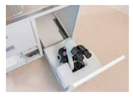
Safe transfer whenever required