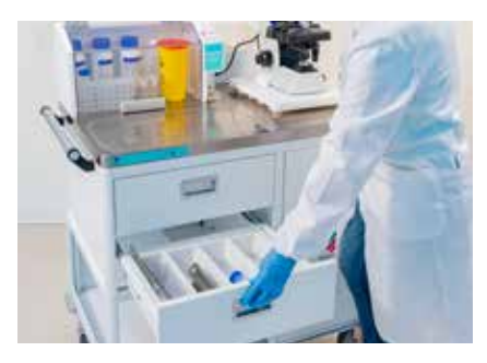
Two large volume drawers to store items needed for the procedure