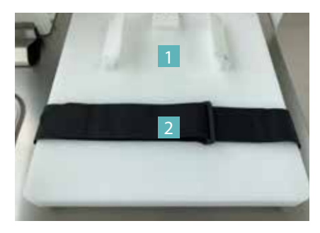
1. Brackets for Olympus CX23 microscope 2. Strap for holding your own microscope